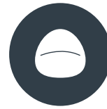
INFLATABLES & BEAN BAGS